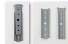
NEW Armetal bayonets with through-hole